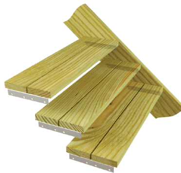
Typical SCA10-TZ installation