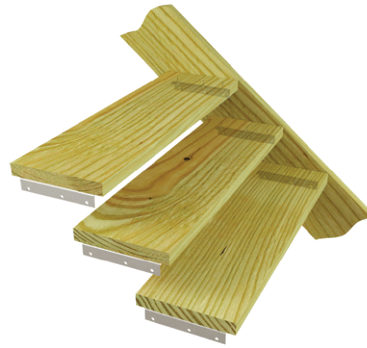
Typical SCA9-TZ installation